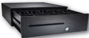
Series 100 1616

Numerous configurations available. See our Heavy Duty Accessories brochure or contact your APG representative for options.